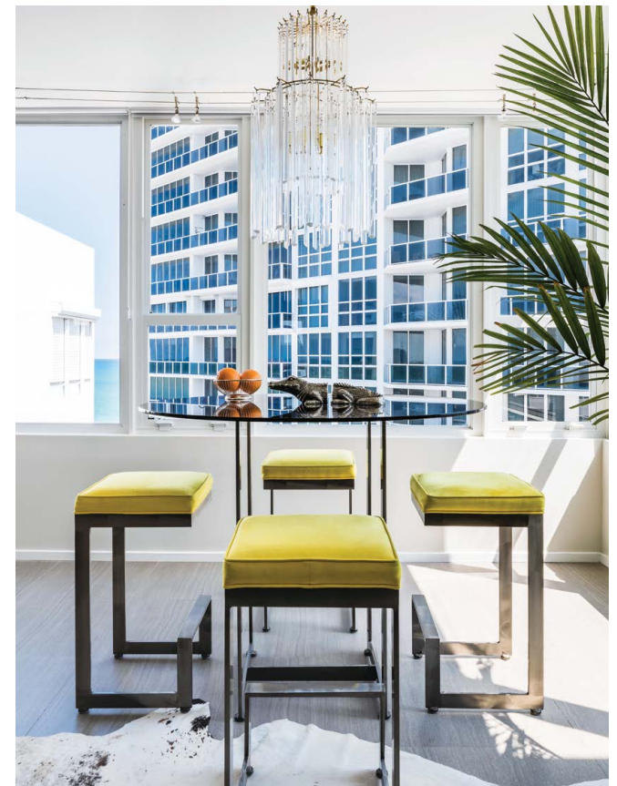
ABOVE: The vintage Italian Lucite chandelier provides a subtle touch of drama above the lounge area styled with art deco flair. "The couple enjoys hosting after-dinner cocktails in different vignettes strategically situated around the main living spaces," designer Anil Kakar says.

Contrasting the neutral backdrop, they chose pops of orange, yellow, blue and green instead of utilizing a typical beach theme. Blue and White by artist Jay Luiz highlights the foyer in prelude to the well-appointed living room. Here, a custom sea foam green sectional joins a pair of art deco club chairs, a lively chaise atop a cowhide area rug from Brazil, and a Yamaha grand piano to shape a social space reminiscent of an elegant coastal night spot. "The wife is learning to play the piano and wanted the living room to have a lounge feel when entertaining guests," Kakar says. "A vintage French sunburst mirror adds a glamorous splatter of gold."